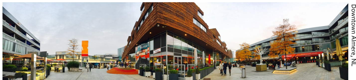
Downtown Almere, NL