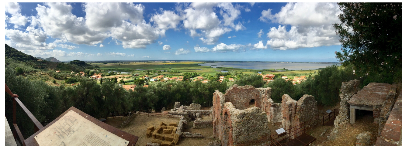
Near Pisa: San Rossore Natr'l Park

Summer School 2018 in France, Italy and the Netherlands Followed by an optional one-month work placement in France