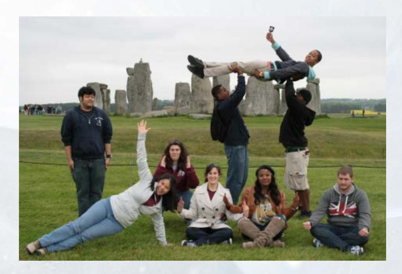
IOWA STATE UNIVERSITY